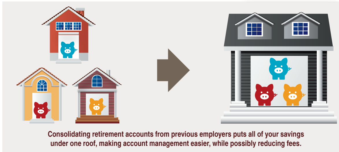
Consolidating retirement accounts from previous employers puts all of your savings under one roof, making account management easier, while possibly reducing fees.